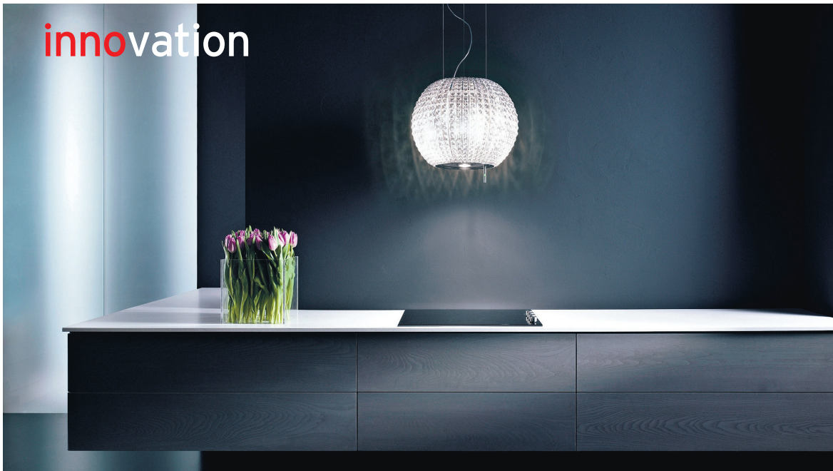
High glam The Elica Collection Star Cookerhood by Integrated Appliance Group looks like a crystal lightshade but is in fact a rangehood and extractor fan.