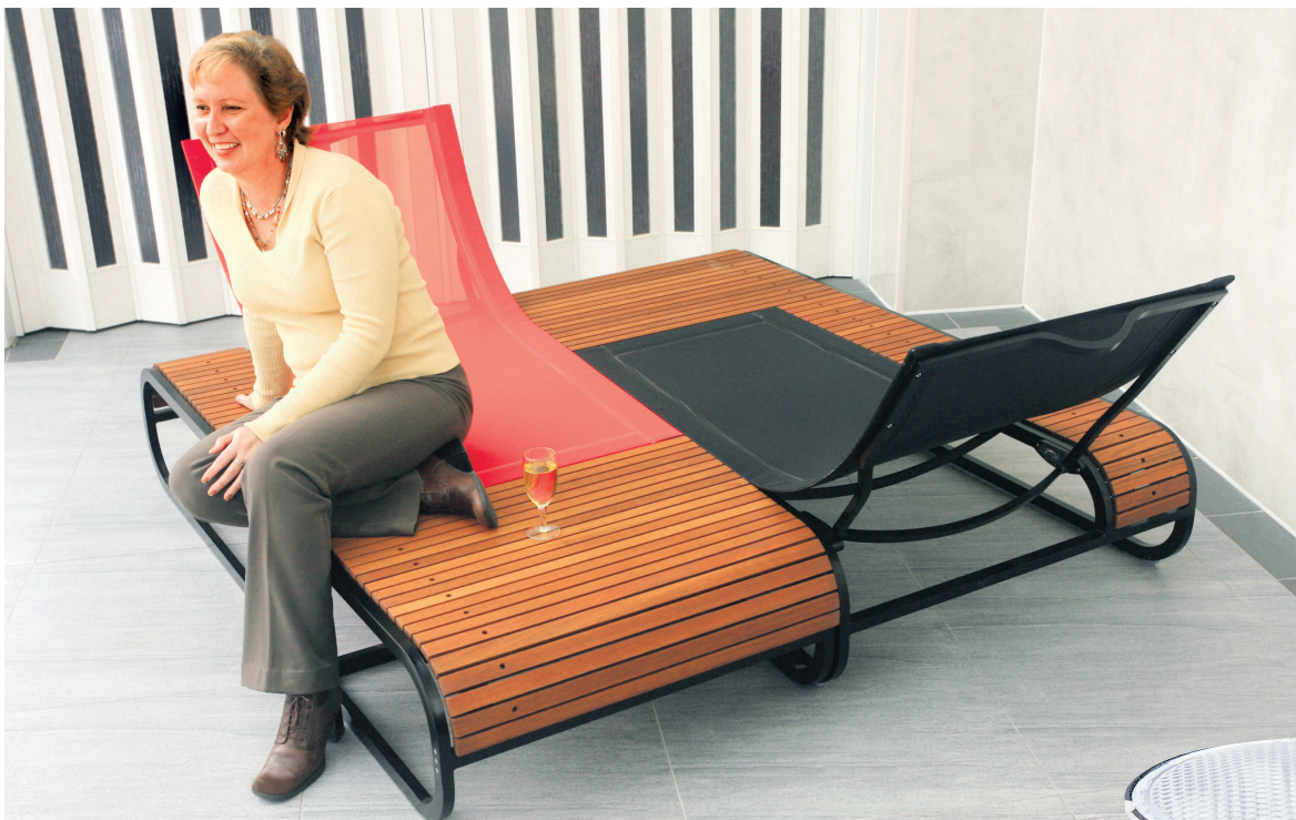
Change of direction Classeque Leisure Products' tandem sunlounger can be used side by side or, as seen here, facing each other.