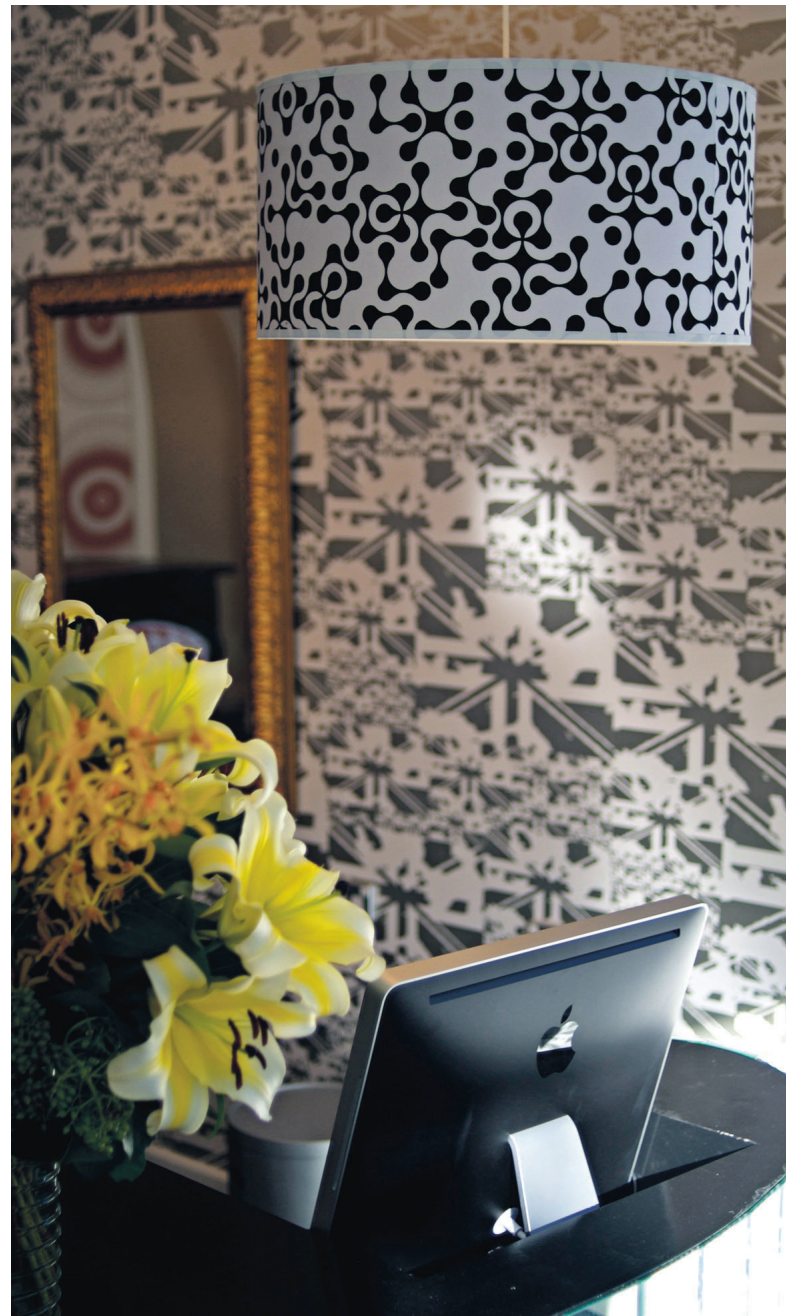
Sixties feel Stevie English wallpaper produced by Sydney design company Afficionados of the Nod.

screened onto silk sheets and hand-coated with high wet-strength gloss so that its finish remains durable. The range is available from Afficionados of the Nod's Surry Hills showroom and priced at $320 per 10.5-metre roll. See www.afficionados.com.au .