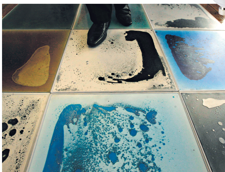
Trick of the tiles Liquid Floor Tiles by Academy Tiles are non-slip and use two non-toxic, coloured substances and a faintly flexible top.

The Stevie English wallpaper range, heavily influenced by Britain's rock'n'roll culture of the 1960s and 1970s, is a modern collection produced by Sydney design company Afficionados of the Nod. The pattern, which picked up the award for best fabric, reworks the Union Jack symbol